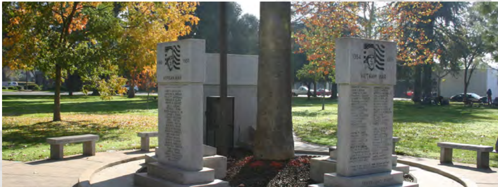
The Merced County Veterans Memorial, located in Courthouse Park, is slated to be restored

In November, the Board of Supervisors voted unanimously to allocate $6,000 of District Two's Special Project Funds to restore the memorial, which serves as a solemn tribute to those who sacrificed themselves for our freedom. Restoration will begin soon.