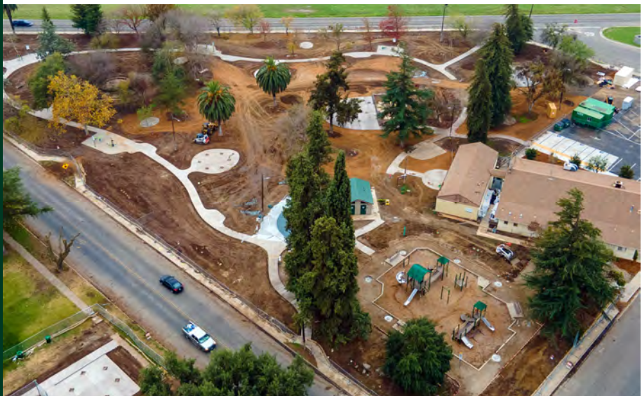
An aerial photograph of Houlihan Park in Planada, taken on November 16, 2021