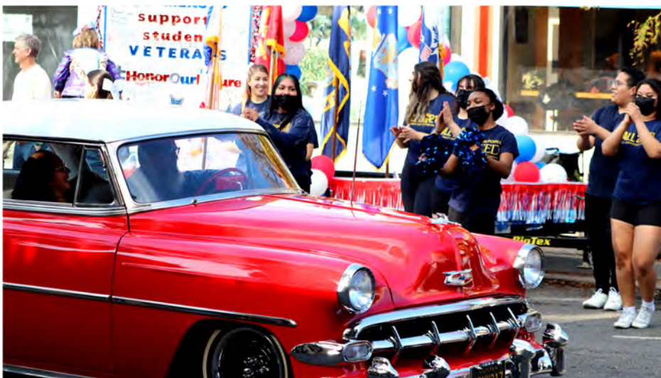
A participant drives through the 2021 Merced County Veterans Day Parade in Merced

In November, the Merced County Veterans Service Office (VSO) hosted its annual Veterans Day Parade with a different spin to help stem the spread of COVID-19.